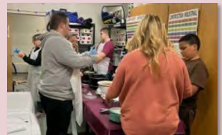
Students enjoyed Thanksgiving treats in Ms. Planz's class.