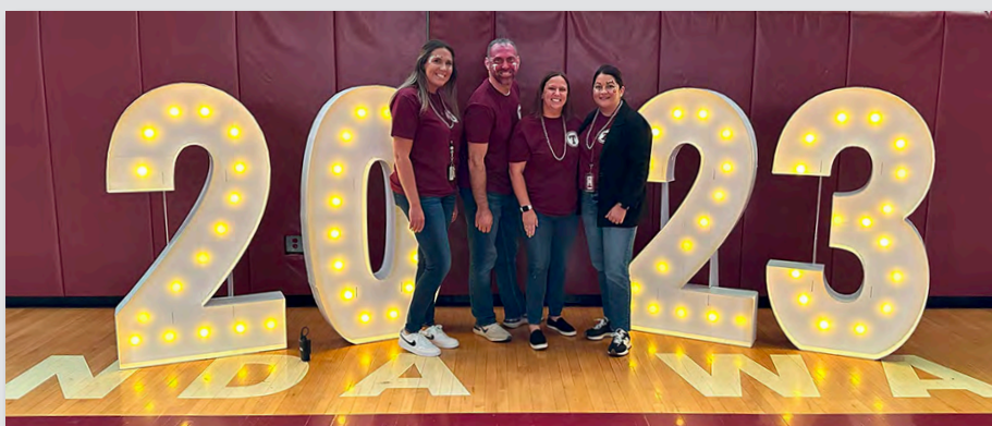
Fun was had by the entire community at T-NT Week!