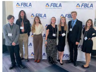
Future Business Leaders of America students traveled to Providence, RI in November for a National Leadership Conference, where they attended several workshops on career and college topics.