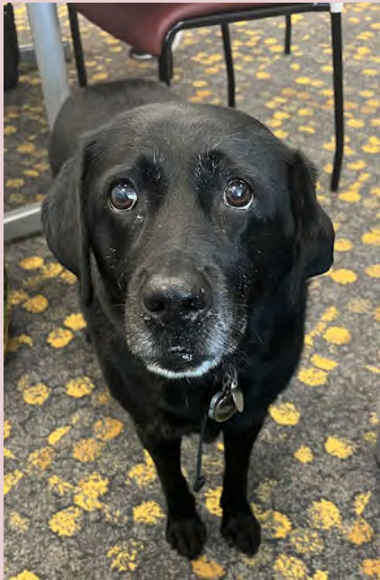
Storm, our TES therapy dog, plays an important role supporting the social and emotional needs of our students.