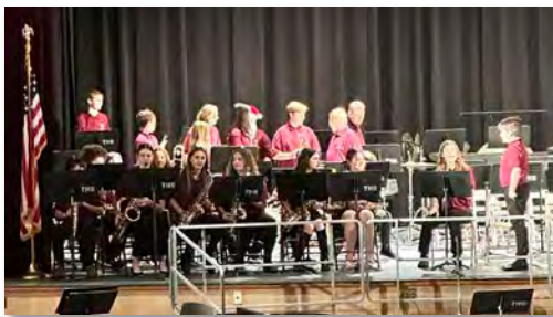
It was a full house as the choral and instrumental students performed at the Middle School's annual winter concert.