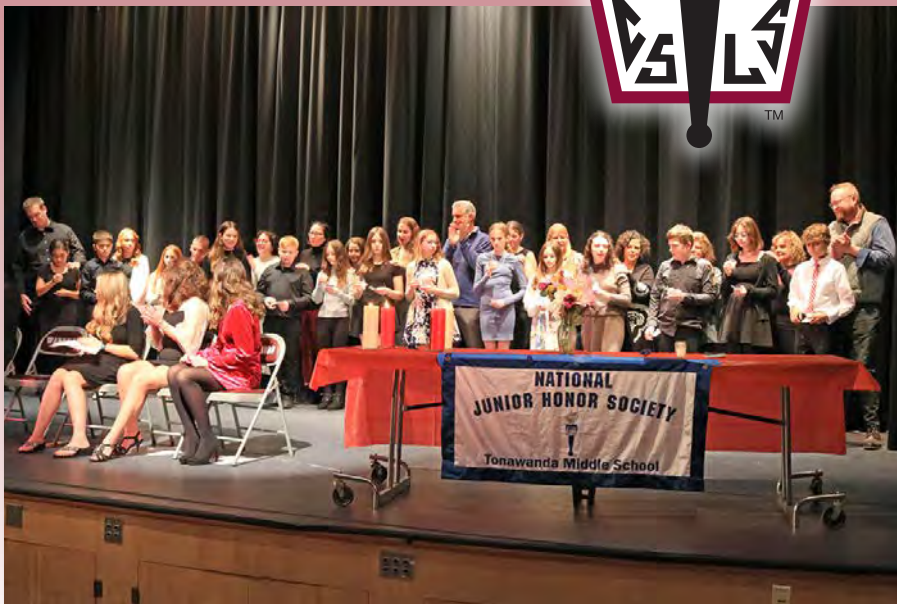
2023-2024 National Junior Honor Society Inductees