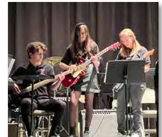
The auditorium came alive for the high school winter concert with performances by the Mixed Chorus, Concert Chorale, Jazz Band and Concert Band.