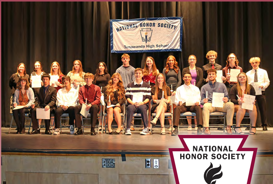
2023-2024 National Honor Society Inductees

A total of 42 students were inducted into the National Honor Society and National Junior Honor Society, programs that focus on empowering students with the skills to become leaders in school and the community.