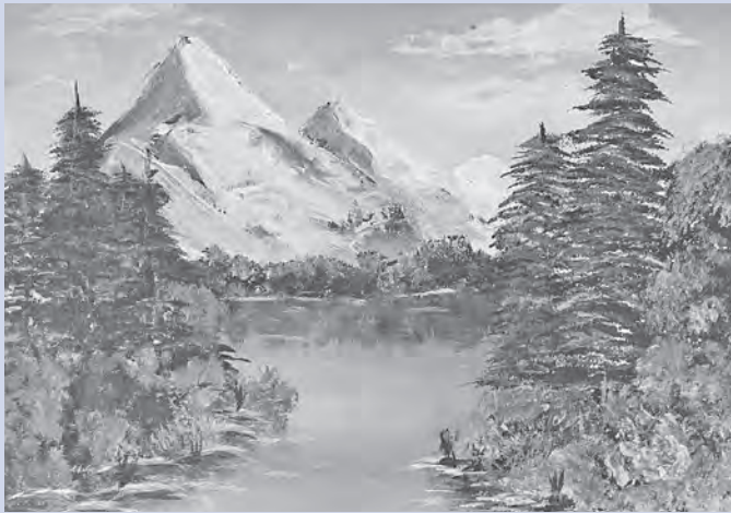
London Harsch, Grade 8