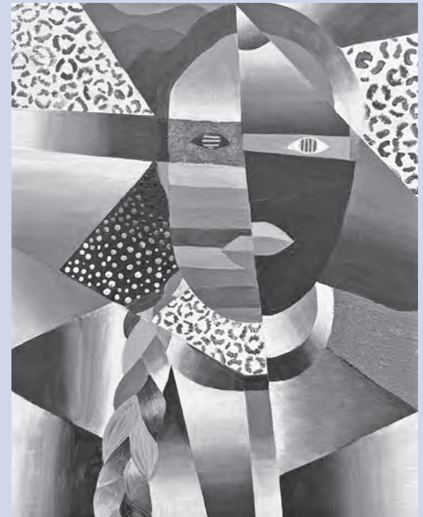
Alayna Schwinn, Grade 10