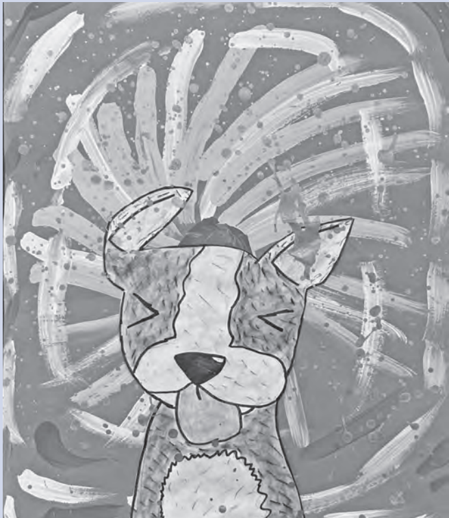
Piper Robey, Grade 4