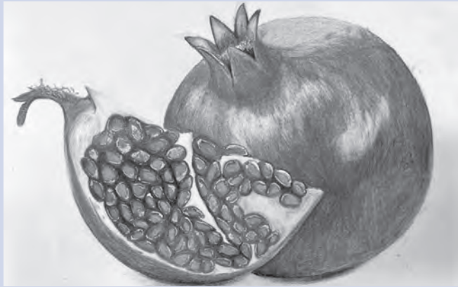
Hazel Shepard, Grade 8