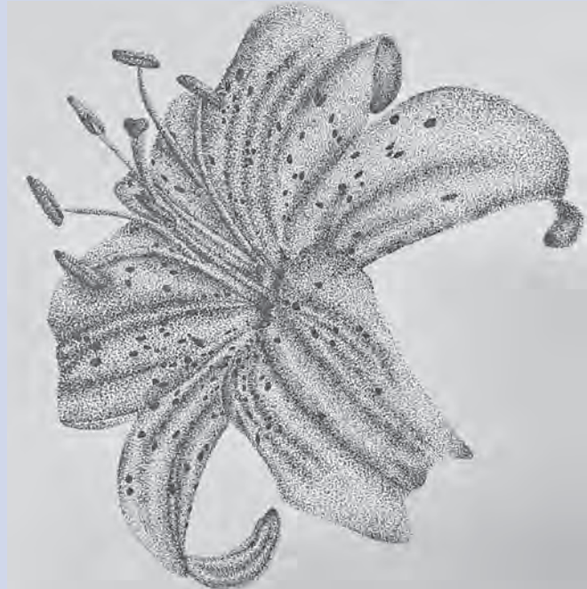
London Harsch, Grade 8