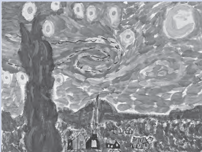
Kolton Kish, Grade 5