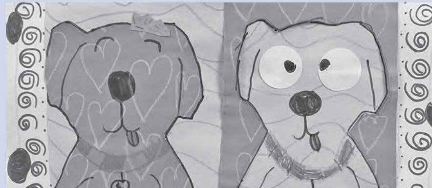
Liliana Palazzo, Grade 1