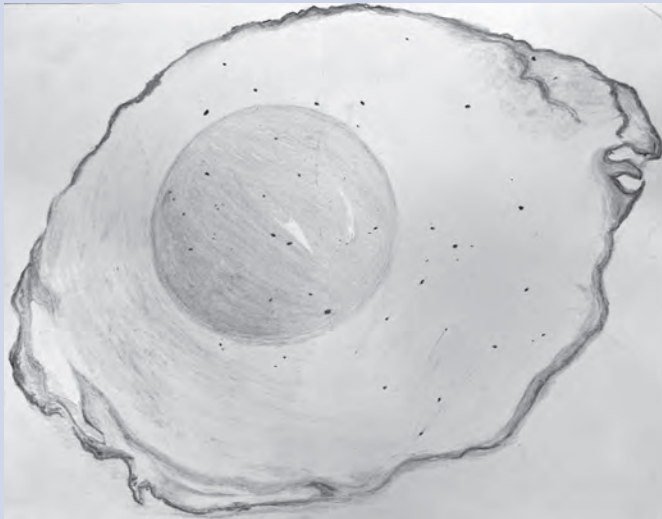
Than Hlaine, Grade 8