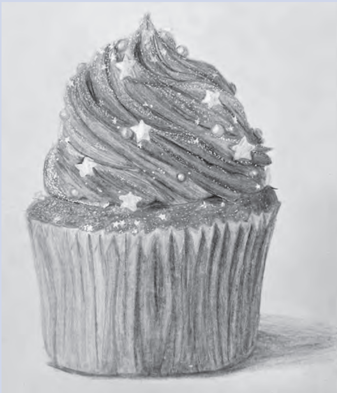
Sophia Myers, Grade 8