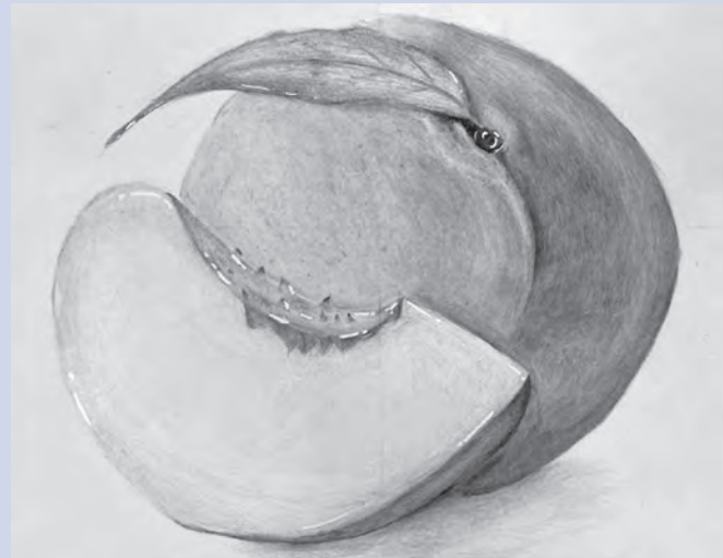
London Harsch, Grade 8