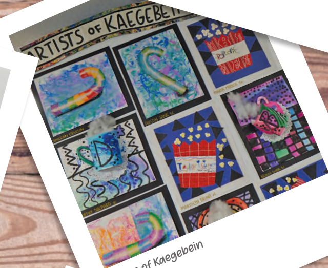
Artists of Kaegbein