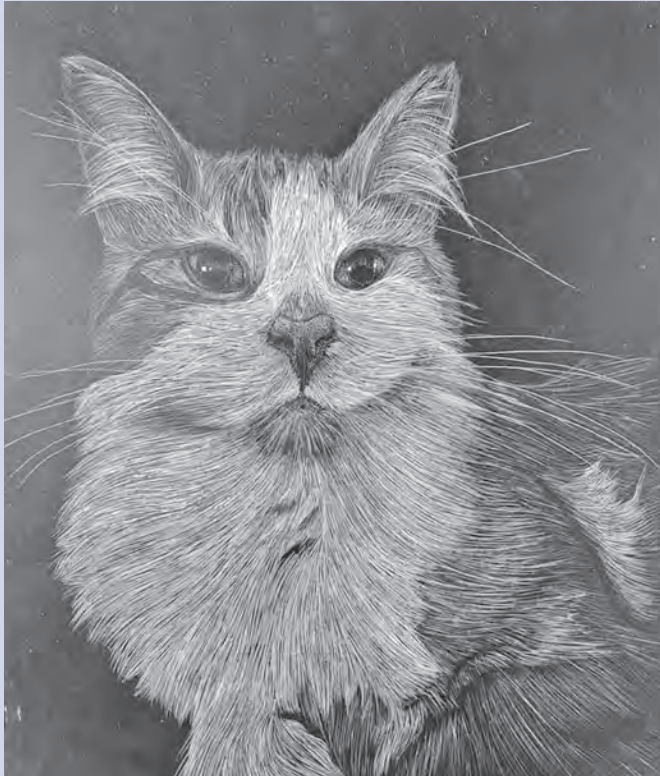
Hazel Shepard, Grade 8