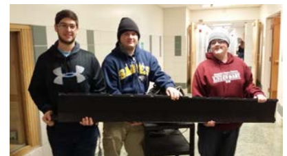
“Electronics & Computer Technology students restore Vietnam-era RADAR antenna for the Buffalo Naval Park.”