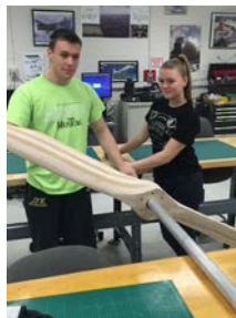
“Aviation students at Harkness test their propeller for balance.”