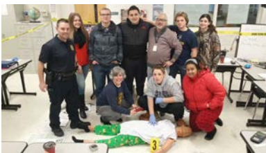
“Criminal Justice students at Potter learn to crack cases.”

Erie 1 BOCES’ career centers are on Twitter. Check out some recently Tweeted photos of students in action. To access all Twitter pages see the locations page on www.e1b.org .