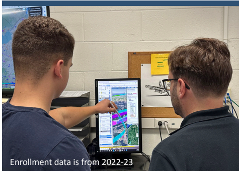
Enrollment data is from 2022-23

As part of public education, Erie 1 BOCES offers a variety of career and technical programs during the regular school day to high school students in Erie County. High school students interested in learning more about how they can participate in various programs, such as cosmetology, barbering, fashion design technology, baking and pastry arts, nursing, health careers, building trades, collision repair, sports science, engineering and robotics or aviation technology, should visit www.e1b.org/cte or speak with their high school counselor.